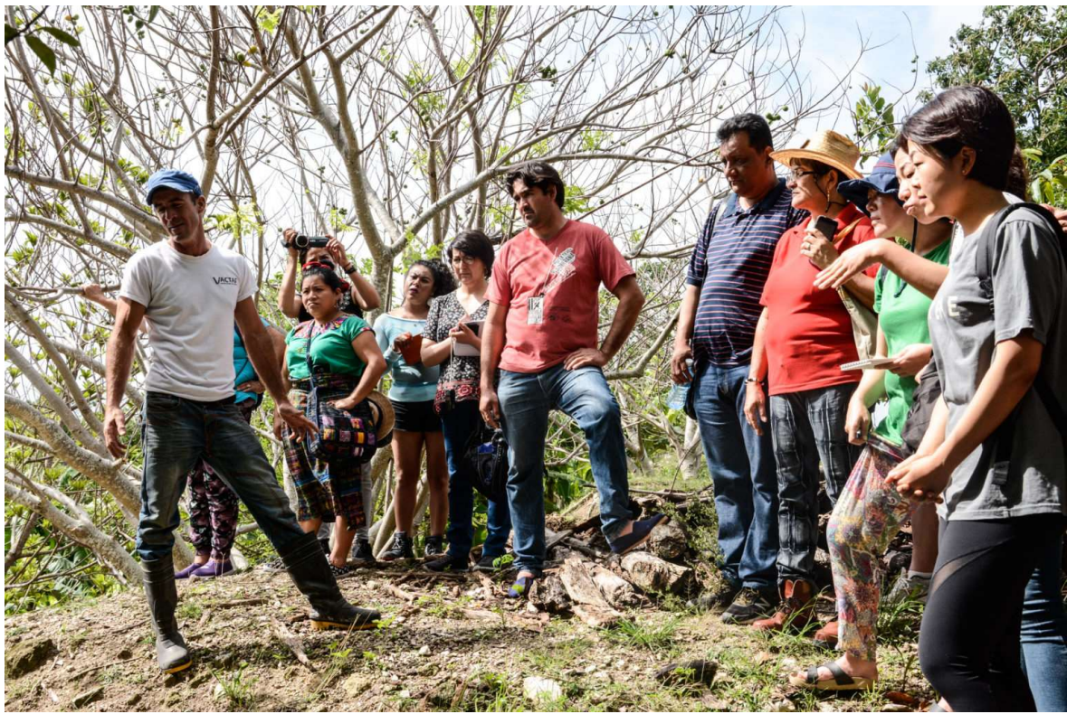
Campesino a campesino learning

The authors analyse the conditions that enable and disable agroecology's potential and present six 'domains of transformation' where it comes into conflict with the dominant food system. They argue that food sovereignty, community-self organization and a shift to bottom-up governance are critical for the transformation to a socially just and ecologically viable food system.